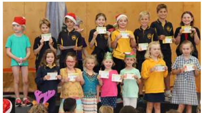
Walking School Bus Ten Walks