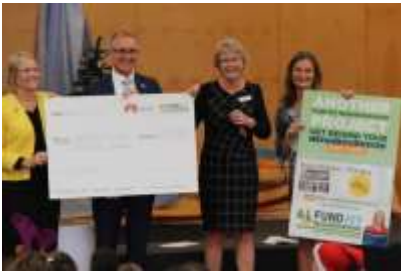
Special visitor Jay Weatherill to present us with the cheque for the 'Fund my Neighbourhood' nature playground.