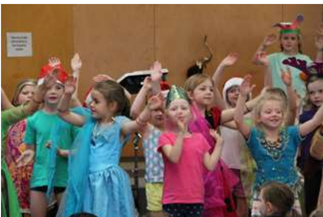
Leading the school in an Aussie version of Jingle Bells